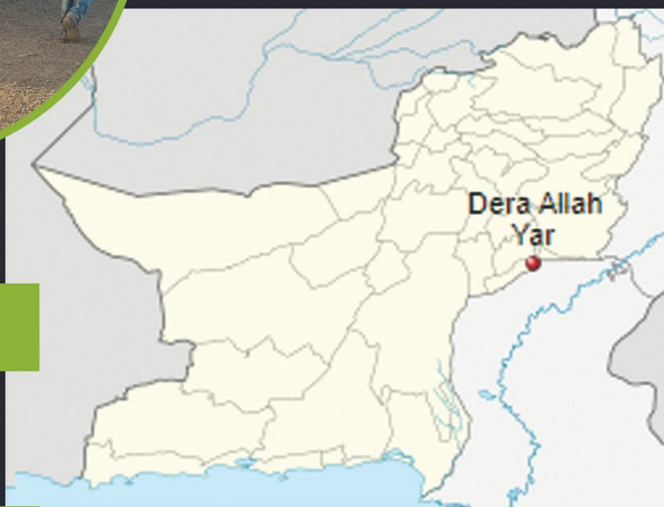
Location within Pakistan